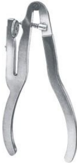
2501 Ivory 160 mm