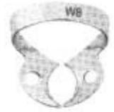
2535 - W8 Wingless