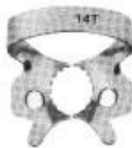
2541 - 14T Edged Winged