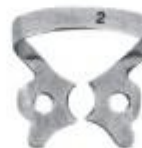
2523 - 2 Winged