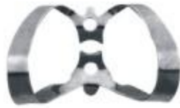
2510 - 9 Winged Labial Clamp