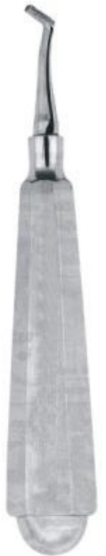
2504 Mershan 140 mm