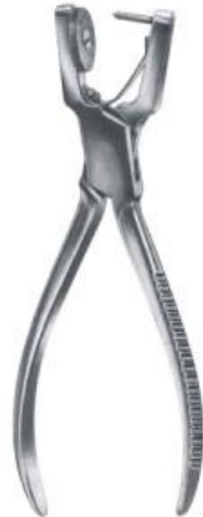
2503 Ainsworth 170 mm