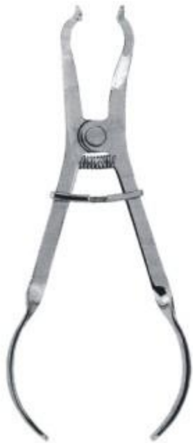
2505 Ivory lightweight 170 mm