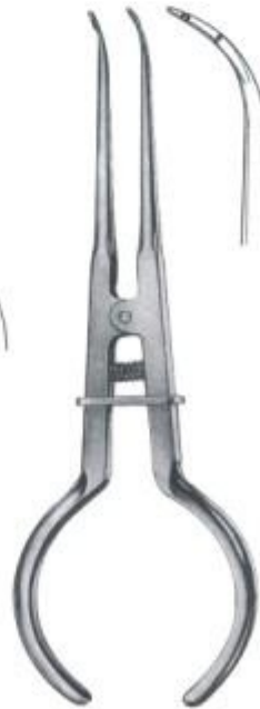
2508 White 175 mm