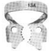
2539 - 13A Wingless