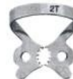
2524 - 2T Edged, Winged