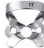
2518 - 1T Winged