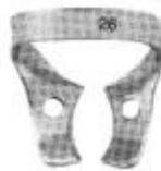
2545 - 26 Wingless