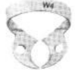
2531 - W4 Wingless

For Small Lower Molars With Round clamps