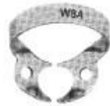
2537 - W8A Wingless