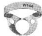
2544 - W14A Wingless