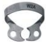
2522 - W2A Wingless