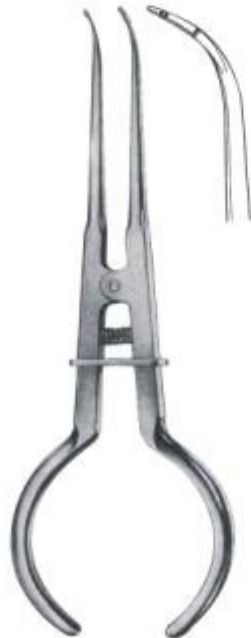
2506 Brewer 175 mm