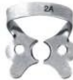
2520 - 2A Winged