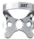
2521 - 2AT Edged, Winged