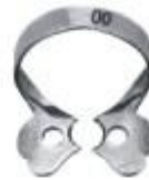
2514 - 00 Winged