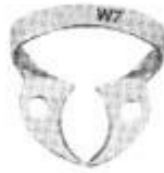
2533 - W7 Wingless