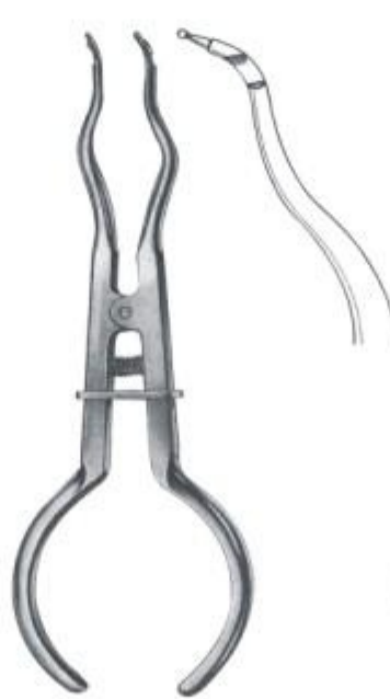
2507 Brewer 175 mm