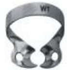
2519 - W1 Wingless

For General Use With Adjustable Jaws According To Gingival Line Shapes