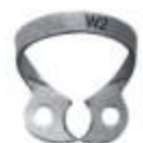
2525 - W2 Wingless