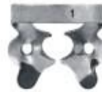
2517 - 1 Winged