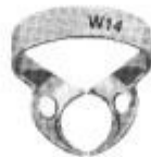
2542 - W14 Wingless

For Round Molars, Partially Broken, Undersized or Inclined