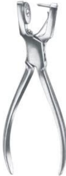
2502 Ainsworth 170 mm