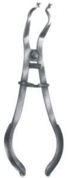
2509 Ivory 170 mm