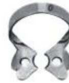
2515 - 0 Winged