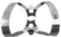
2511 - 9T Winged Edged Labial Clamp