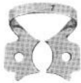
2532 - 7 Winged