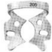
2548 - 205 Winged