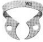
2529 - W3 Wingless