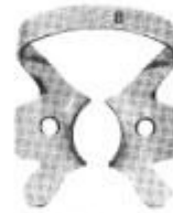
2534 - 8 Winged